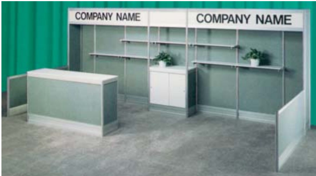
GEN 4 10' x 20' Standard Unit