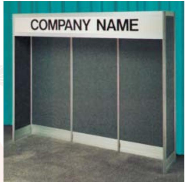
GEN 2 10' Back Wall Unit

Make your next trade show exhibit a stylish affair with standard or customized displays. General Exposition Services has a large selection of display models and accessories to help your visitors feel welcome and interested as they tour your exhibit.