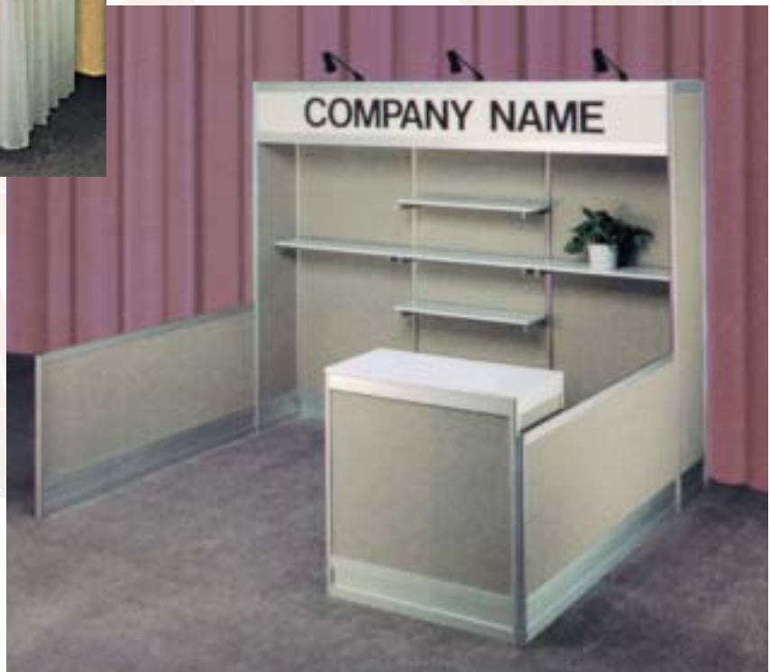
GEN 3 10' x 10' Modular Rental Unit