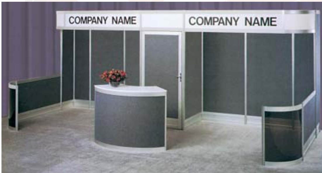
GEN 5 10' x 20' Custom Unit